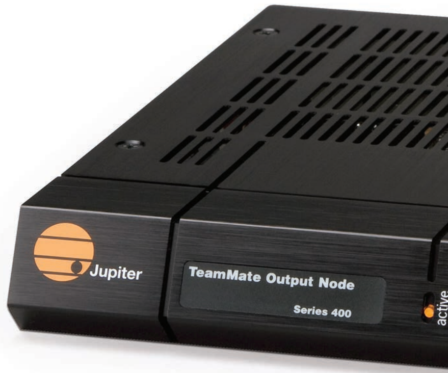
PixelNet Domain Control™

PixelNet networks are automatically self-organizing, there is no need for complicated setup. Every node, both input and output, is identified and available for use the moment the node is plugged into a PixelNet installation. All sources can be displayed on any of the output devices. Add an input node, swap for another type of input node, or remove an input node and the system reconfigures the topology.