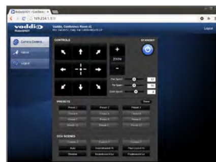
Example: Built-in Camera Control Web Page